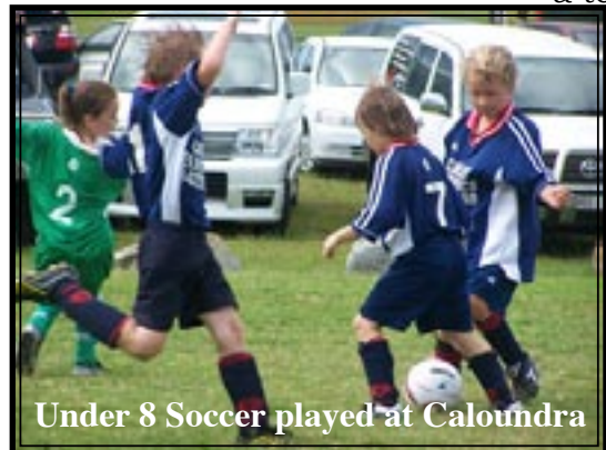
Under 8 Soccer played at Caloundra

The final score was 5-0 to Kawana but this was not a true reflection of the game.