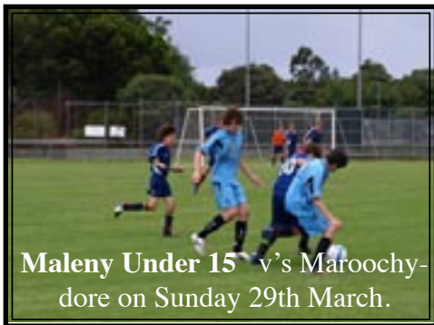
Maleny Under 15 v's Maroochy-dore on Sunday 29th March.

After a tough game on Saturday the boys were up against a very skilful Maroochy-dore side who were short on numbers.