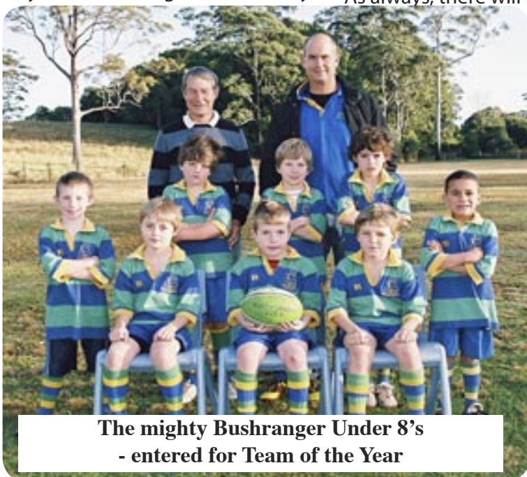
The mighty Bushranger Under 8's - entered for Team of the Year

Administrator/Volunteer of the Year Award".