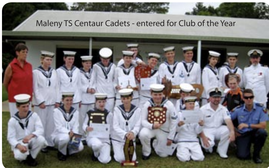
Maleny TS Centaur Cadets - entered for Club of the Year

There are so many fantastic vol-unteers working hard behind the scenes every week in our commu-nity organisations - what better way to acknowledge them than by