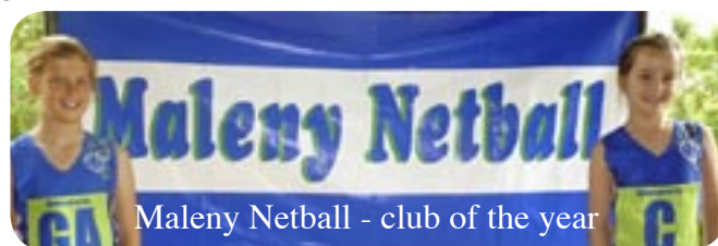
Maleny Netball - club of the year