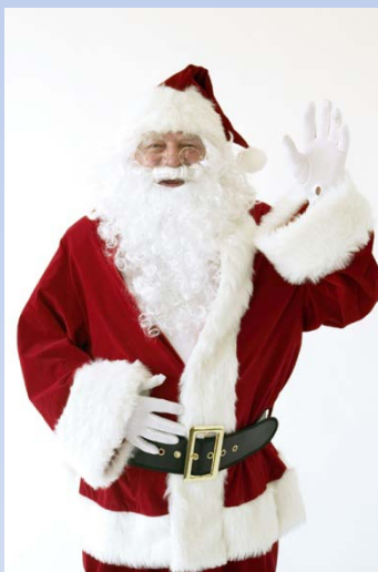
Photo with Santa

Guess the weight of the Christmas pudding