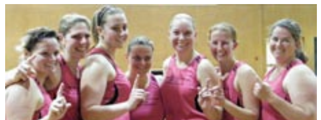
Pink Ladies: Winners Ladies Comp 2010

The 2011 season will run from late February to mid September. Games are played in the Maleny Indoor Activity Centre at the High School.