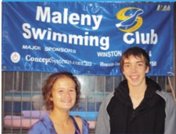
Maleny Swim Club Captains 2010 - 2011