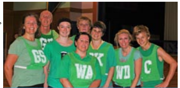
Green Team: Winners Mixed Comp 2010

In the Mixed Grand Final, Dolphins (Minor Premiers) were up against Green Team. Green Team came out firing on all cylinders and quickly amassed a handy 5-point lead. The rest of the game was hard fought, with Green Team hanging on to win 28-24.