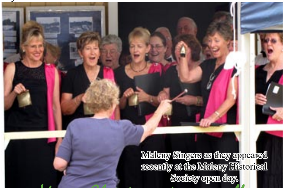
Maleny Singers as they appeared recently at the Maleny Historical Society open day.