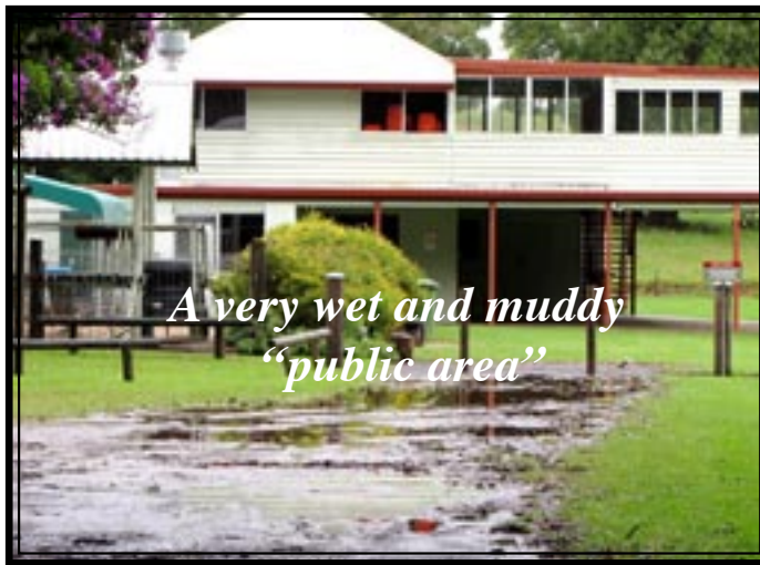
A very wet and muddy “public area”

Although naturally disappointing for the players and families,