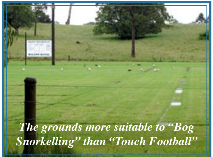
The grounds more suitable to “Bog Snorkelling” than “Touch Football”

For more information visit our web site: