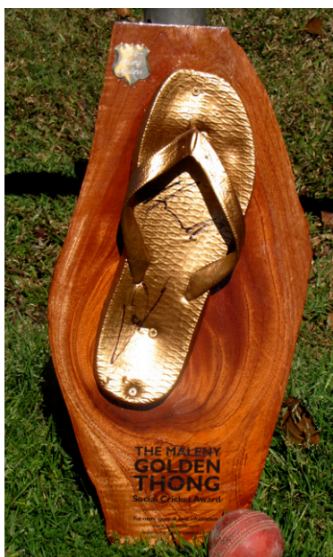
Playing for the Golden Thong Award (won by Maleny Maulers 2010)