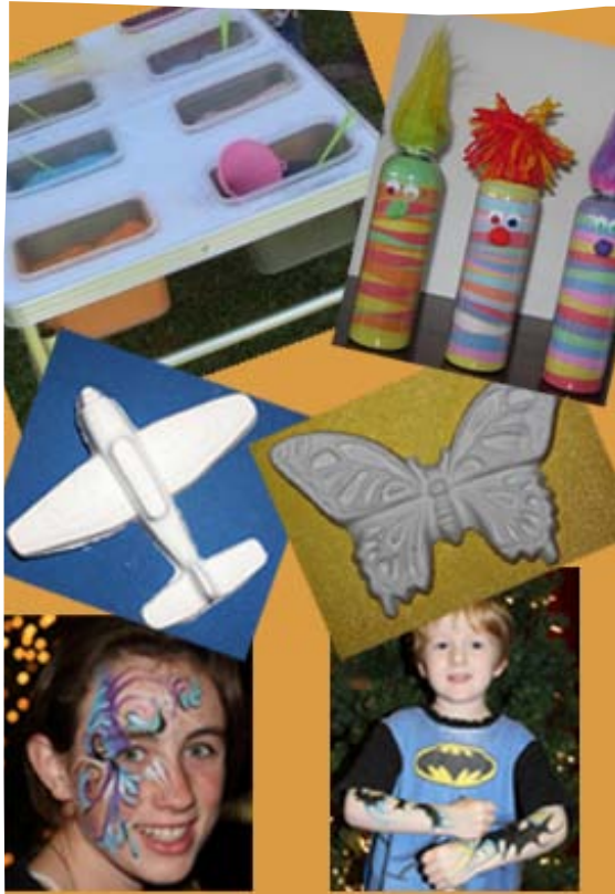
Kids Craft Activities & Facepainting