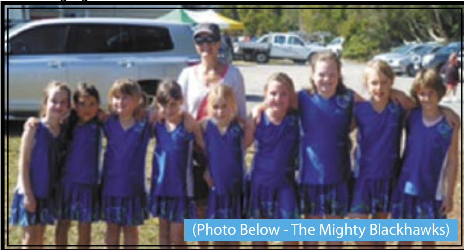
(Photo Below - The Mighty Blackhawks)