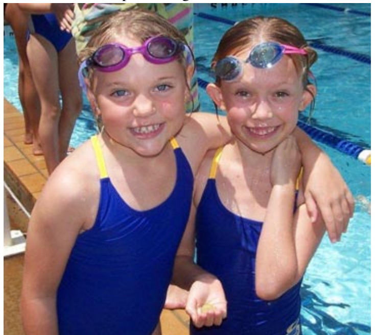
Two of our younger swimming champs. They have a bright swim future in front of them!