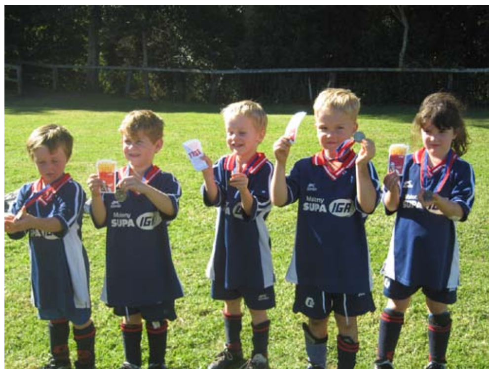
Future Soccerroos and Matildas!

The Brisbane Roar will be conducting a junior soccer training clinic in Maleny from the 8th to 10th July inclusive. The Maleny Rangers Soccer Club is delighted to be able to offer this opportunity to the Maleny and district soccer families. Thanks to the generous support of Woolworths (through their community grants programme), the soccer club will see 60 players taking part in the coaching clinic. Another result of the financial support from Woolworths is that the club has been able to subsidise each player, meaning that participants only have to pay $50.00 for three days of professional coaching. The clinic will provide new skills and polish old ones. The clinic was opened to players aged 6-14 years. The Maleny soccer club is enjoying one of its most successful years, with 5 teams having realistic chances of making the finals, including 3 of the girls' teams. The soccer club committee and families are extremely thankful to Woolworths for their support.