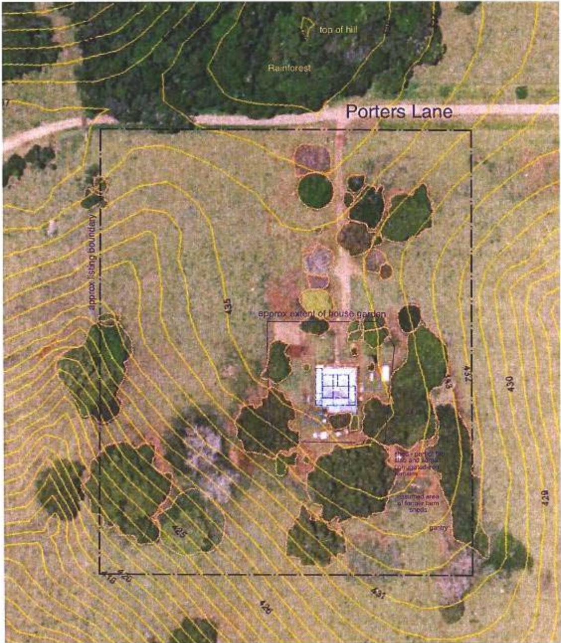
The listed area and associated features Roger Todd 2008